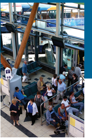
What is travel training?

The aim of a travel programme is to enable people with a learning disability to develop a range of skills and build confidence to travel either supported or unsupported to college, work placements and in the wider community using appropriate methods of public transport confidently and safely.